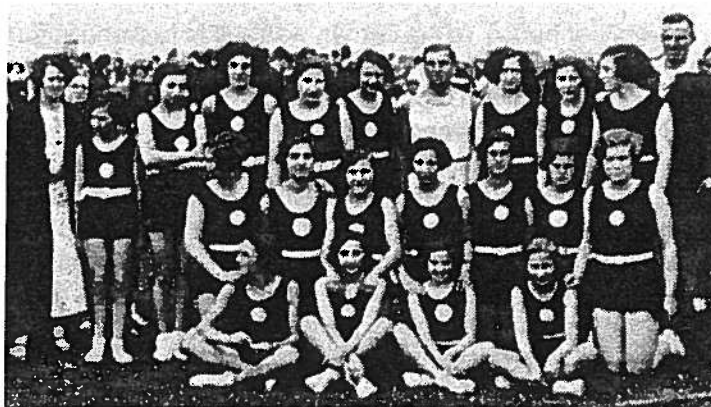
Jewish Gymnastic Club

their children perform? There was also lots of good food for sale those evenings. Like "broodjes half om" (half corned beef and liver worst sausage) and gebakjes (pastry). But, it was too much money for my mother to buy all this for us. But, as with everything else, she had a perfect solution for this problem. At home she prepared everything and brought it with her to eat that evening. That way, we did not feel left out and it was much more reasonable. Quite often our "broodjes" and "gebakjes" tasted better than the stuff they sold at the stands.