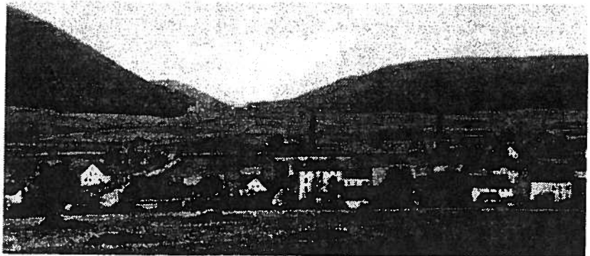
The town of Liebau where I worked in a labor camp from October 29, 1944 to the end of the war on May 7, 1945.