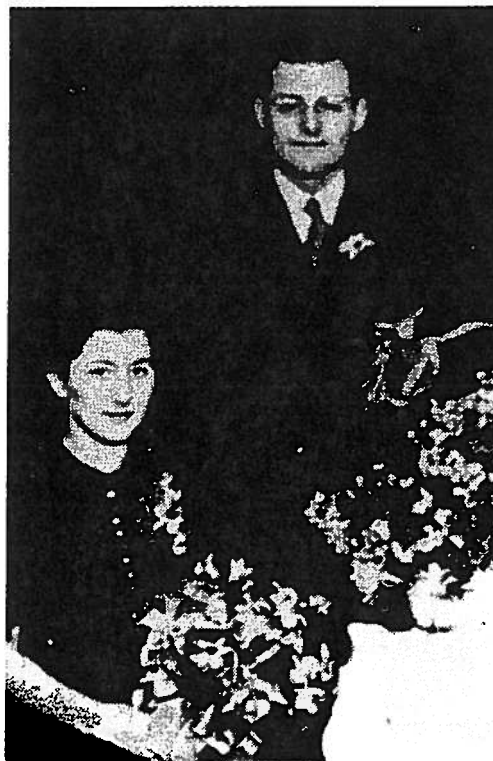
Our wedding day, December 20, 1942, in my parent's house. My bouquet and the ribbon on the basket cover the yellow "Jood" stars we were forced to wear.

My mother's second cousin had a job with the Jewish Council in the department "help to deporting Jews." He offered my brother a job there to ride a three wheel carriage bike. This was to help carry the backpacks for the Jewish people who were picked up by the Germans. Through that job my brother got a "sperr". Of course, there was no pay involved. But, really every day you could manage