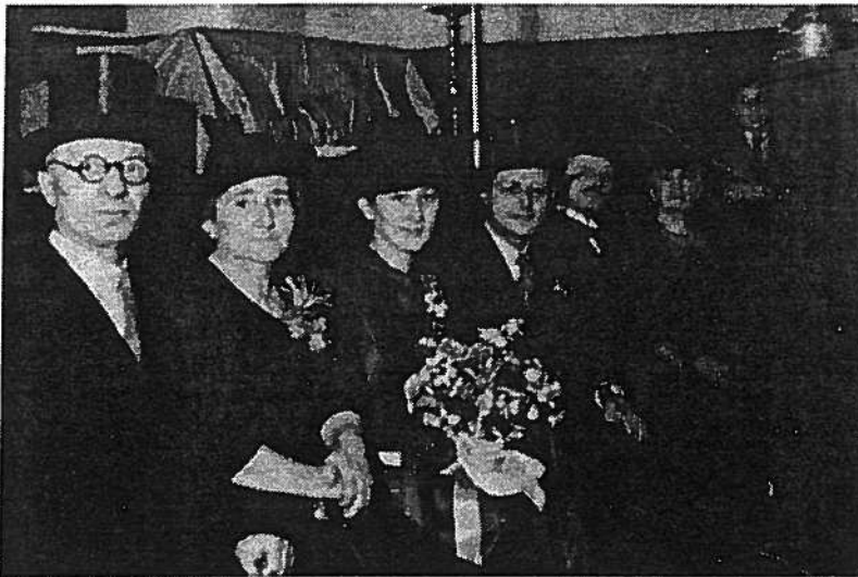
Our wedding took place at the synagogue in The Hague on the Nieuwe Molstraat.