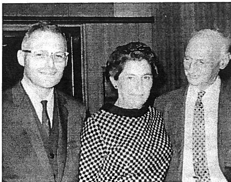
Photo taken in September, 1967 in Amsterdam on a visit to Holland. Sal, Rose, Otto Frank.

I ended up in a labor camp in a little town named Liebau in upper Silezie, part of Poland, with about 200 other Jewish prisoners. We had to work in a factory where we made snowchains for military trucks. After a couple of months, they ran out of material. Then we were put to work in a field where we had to make a landing strip for airplanes. We had to make rock, by blowing up parts of a mountain with dynamite. Then carry those rocks to the field for a landing strip. The fact that I also speak German and French helped me a great deal during my imprisonment. It was very important to be able to understand the instructions given by the women soldiers who were our guards. I could also overhear their conversations. They became more and more discouraged about the outcome of the war, which made us feel better. I never let them notice that